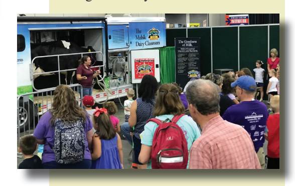
Above: MDC instructor presenting to the crowd during the Kentucky State Fair.

"Uniquely Kentucky, Uniquely Fun", was the theme for the Kentucky State Fair which was held August 17-27, 2017 in Louisville, Kentucky. This theme seemed very fitting since our Mobile Dairy Classroom offers a "unique" way to present our dairy message to the public. Southland Dairy Farmers held a strong dairy presence by sharing our message about the importance of dairy in our daily diet and a brief overview of the modern milking process with live milking demonstrations to over 14,000 fair attendees. Dairy nutrition information and promotional items were also handed out during the fair by our MDC instructors.