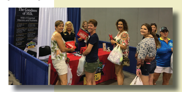
Above: The Health and Fitness Expo attendees excited to receive a cooler bag and hear about chocolate milk as their post work out drink.

Southwest Dairy Farmers attended the 44th annual Hospital Hill Run in conjunction with The Health and Fitness Expo in Kansas City, Missouri on June 1-3, 2017. Over 15,000 people came through the expo which provided SWDF an excellent opportunity to promote chocolate milk as the best sports recovery drink. Chocolate milk contains high-quality proteins that help restore and rebuild muscles after vigorous exercise like running a marathon. The Hospital Hill Run is the oldest race in Kansas City and one of the oldest half marathons in the country. It is also touted as one of the top 25 road races in the United States. The challenging and hilly Hospital Hill Run offers runners a choice of running a halfmarathon, a 10K or a 5K. After the race, runners rehydrated with chocolate milk and enjoyed an ice cream sandwich as a cool treat. This provided a great venue to highlight all the important aspects that chocolate milk offers to runners.