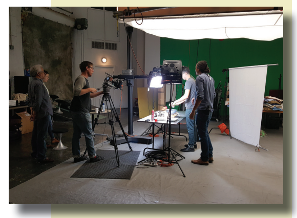
Above: Shooting a "Tasty" dairy recipe video.

stand -and-stir TV show. Southwest and Southland Dairy Farmers see this as a great way to get more views of our dairy inspired recipes and will be a great addition to our video recipes. Be on the lookout for these new exciting videos soon at southwestdairyfarmers.com. If you would like to receive one of our popular Cooking with Dairy Calendars, give us a call at (903) 439-MILK.