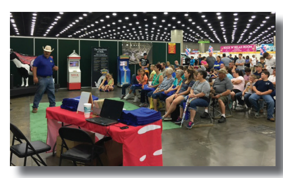
Above: Fair patrons listening to live milking demonstrations during the Kentucky State Fair.

our dairy message. The Kentucky State Fair ran from August 18-28, 2016 in Louisville, Kentucky where Southland Dairy Farmers presented live milking demonstrations where the public was informed how milk goes from the cow to the store and handed out dairy promotional items throughout the Fair.